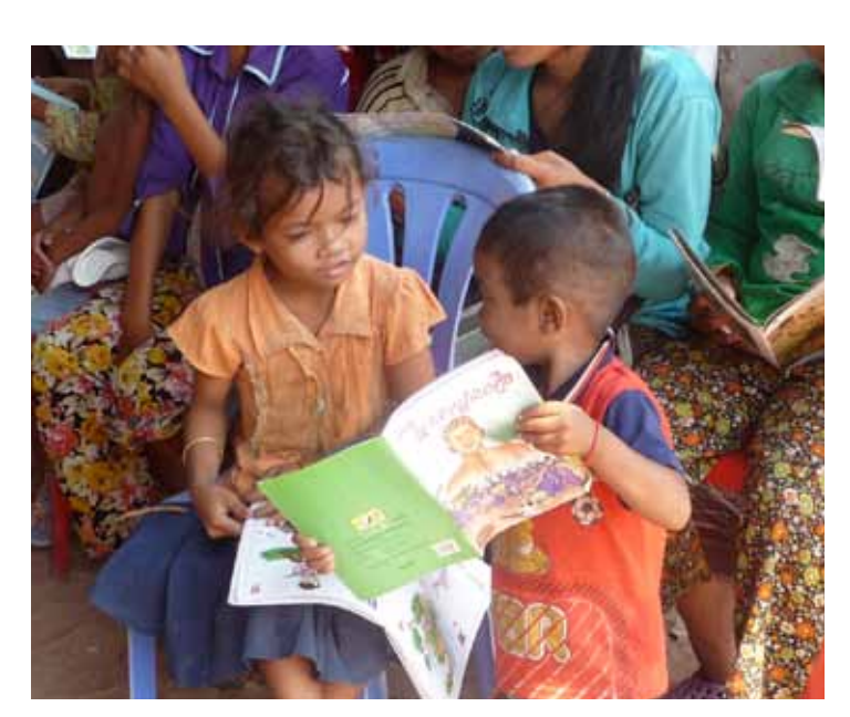
Children enjoying books from one of our libraries.