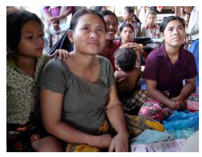
Students taking a literacy class.

As part of the holistic approach envisioned at the beginning of Water for Cambodia, basic education of the village women was considered a cornerstone for success. Our classes are offered mainly to village women who never had the opportunity to learn to read, write or do simple math. Each class has 25 students and runs for six months. They are held in the village usually at night and include education in health, hygiene and sanitation. In 2010 we had over 600 students enrolled with a 94% graduation rate.