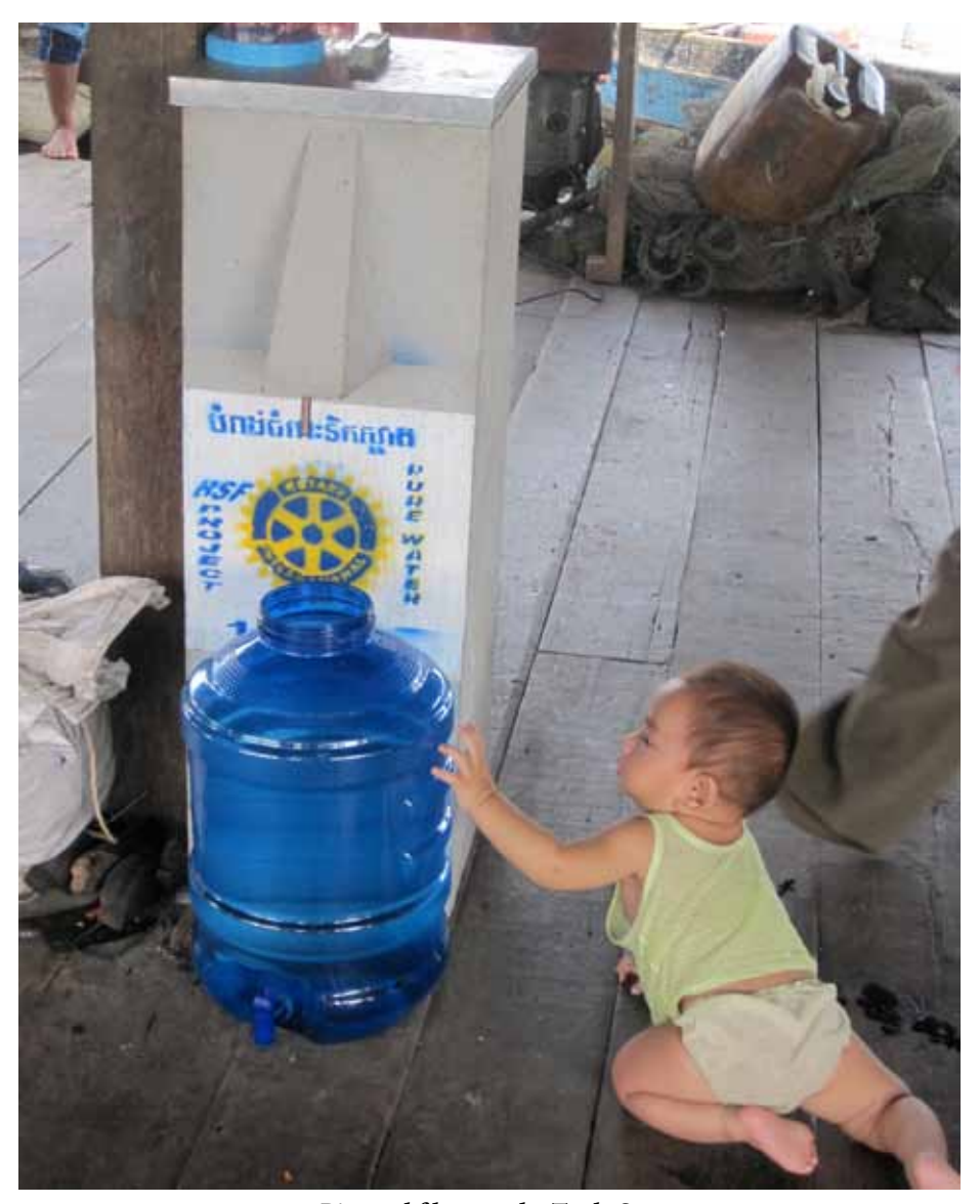
Biosand filter on the Tonle Sap.