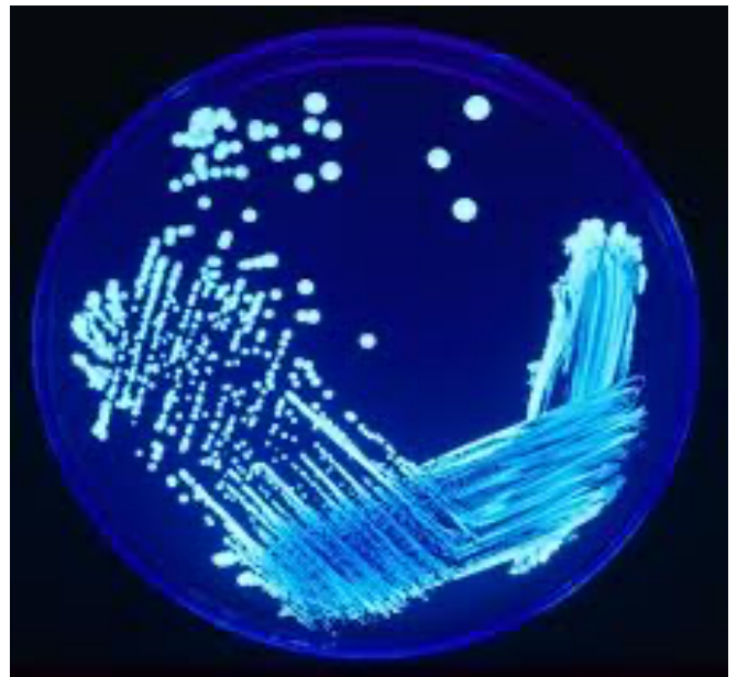
Legionella Pneumophila Culture

The newest capability to be offered is testing for the presence of the bacteria strain causing Legionaire's Disease (legionella). It is found commonly in the cooling stacks employed in commercial cooling systems typical to hotels. In July the lab techs were able to isolate legionella colonies in several water samples. Once isolated and identified, the affected business can then be advised of the appropriate methods for effectively cleaning their systems to eliminate the danger of a Legionaire's Disease outbreak.