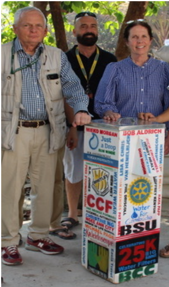
The 25,000 th filter being installed at the WFC office

space and area to accommodate volunteer and donor groups plus room to orient and train large groups. He left the Water for Cambodia operation a stronger and more productive organization.