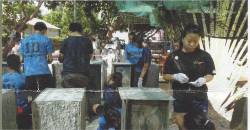
Student volunteers Building filters to install for local village families

In this issue of The Water for Cambodia newsletter we will highlight some of these great volunteer groups along with a few of their observations.