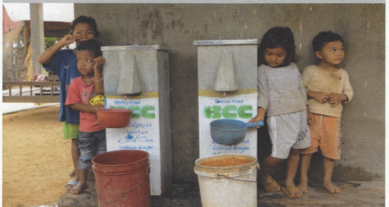
Very happy beneficiaries!