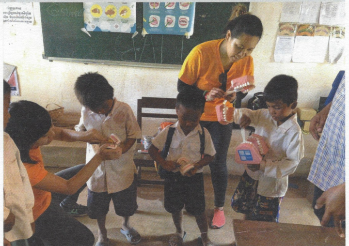
Singapore International Volunteers bring personal hygiene kits and teach young students how to properly brush their teeth

Everyone gets to enjoy the benefits of getting dirty playing in the wet concrete while building filters. Then by participating in actually helping families install their own filters a unique bond of fellowship is forged. Some volunteers take part in demonstrating hygiene practices to school children such as learning to brush their teeth properly while others use their skills to help out testing water in the lab.