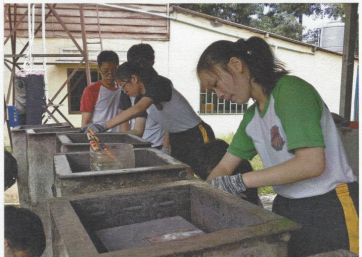
Students from the Whitley Secondary School from Singapore learn to build the filters they will deliver and install.