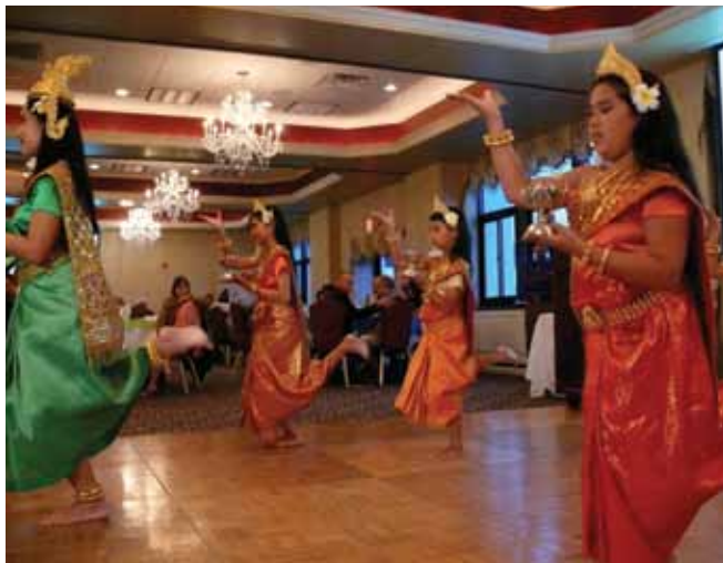
Annual Dinner Fundraiser at the Officers' Club in Newport, RI